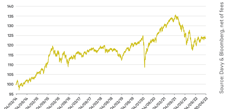
Figure 1: Performance of Davy Cautious Growth Fund at 30 th June 2023.