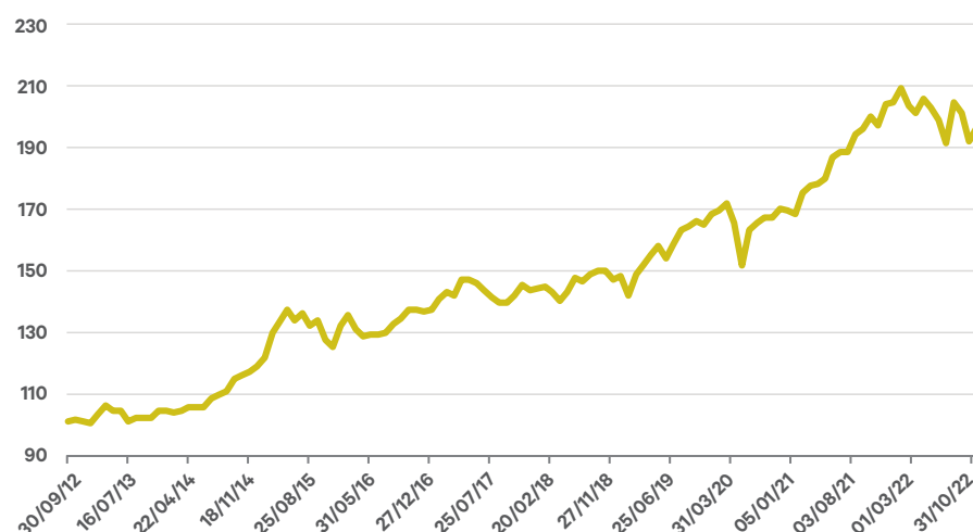
Figure 1: Simulated Performance of Davy SRI Moderate Growth Fund at 31 st October 2022