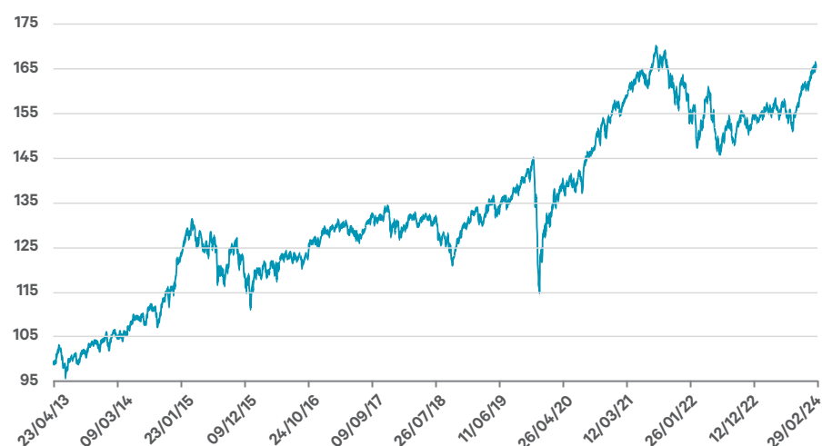
Figure 1: Performance of Davy Moderate Growth Fund at 29 th February 2024 6

Warning: Past Performance is not a reliable guide to future performance. The value of your investment may go down as well as up. This product may be affected by changes in currency exchange rates.