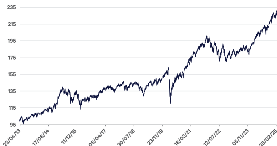
Figure 1: Performance of Davy Long Term Growth Fund at 28 th February 2025 6

Warning: Past Performance is not a reliable guide to future performance. The value of your investment may go down as well as up. This product may be affected by changes in currency exchange rates.