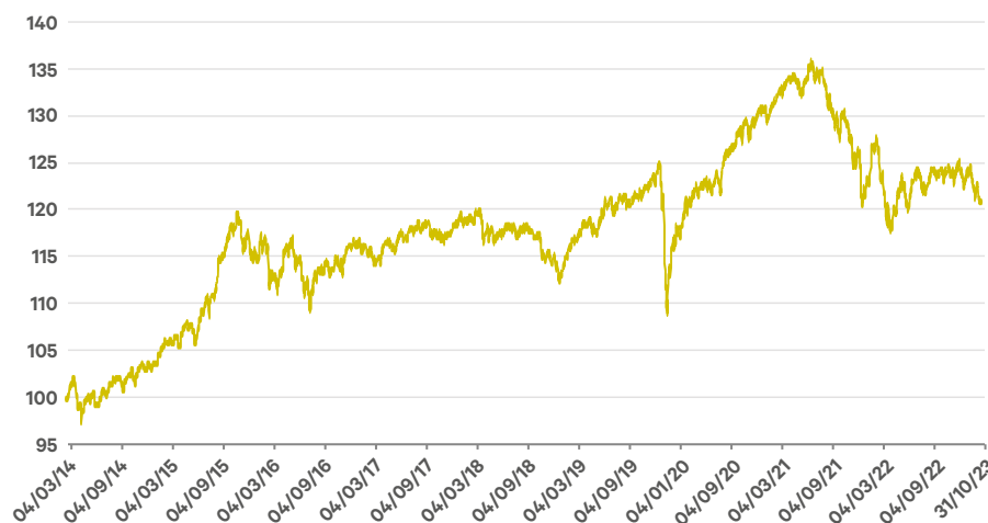
Figure 1: Performance of Davy Cautious Growth Fund at 31 st October 2023 6

Warning: Past Performance is not a reliable guide to future performance. The value of your investment may go down as well as up. This product may be affected by changes in currency exchange rates.