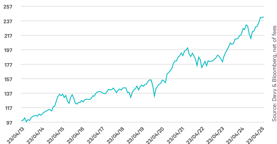
Figure 1: Performance of Davy Cautious Growth Fund at 31 st December 2025.