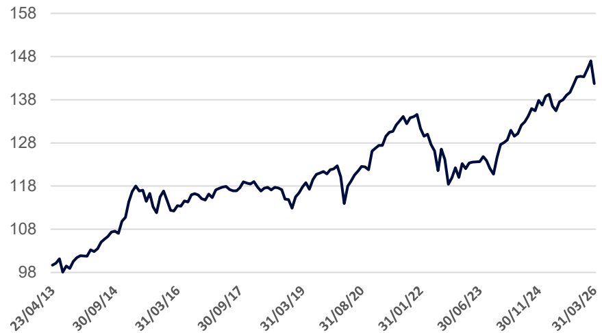
Figure 1: Performance of Cautious Growth Fund at 31 st March 2026 6