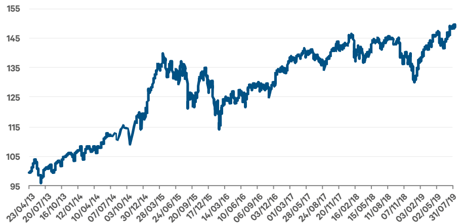
Figure 1: Performance of Davy Long Term Growth Fund at 31st July 2019 6

WARNING: Past performance is not a reliable guide to future performance. The value of your investment may go down as well as up. This product may be affected by changes in currency exchange rates.