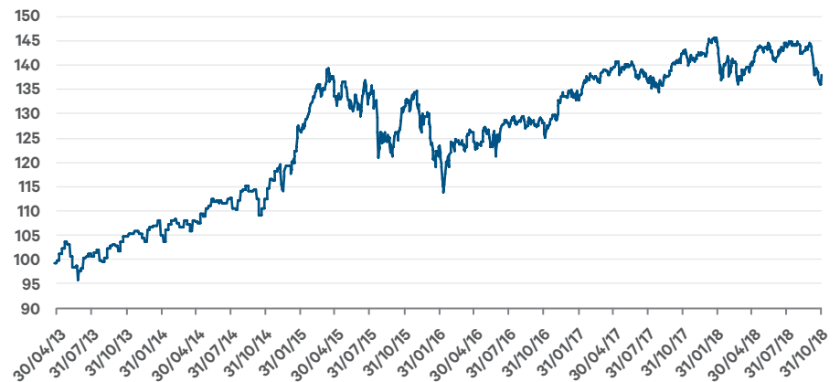
Figure 1: Performance of Davy Long Term Growth Fund at 31st October 2018.

WARNING: Past performance is not a reliable guide to future performance. The value of your investment may go down as well as up. This product may be affected by changes in currency exchange rates.