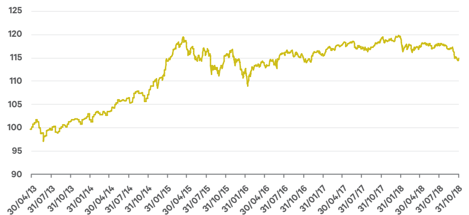
Figure 1: Performance of Davy Cautious Growth Fund at 31st October 2018.

WARNING: Past performance is not a reliable guide to future performance. The value of your investment may go down as well as up. This product may be affected by changes in currency exchange rates.