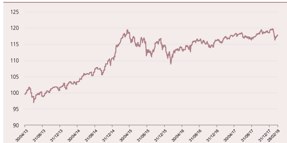
FIGURE 1: SIMULATED PERFORMANCE OF DAVY CAUTIOUS GROWTH STRATEGY

The investment objective of the Fund is to provide long term capital growth through diversification across major asset classes. Within each major asset class, allocations will be further diversified by factors including sector, geography and various strategies.