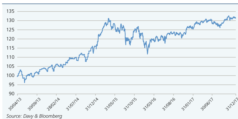
FIGURE 1: SIMULATED PERFORMANCE OF DAVY BALANCED GROWTH STRATEGY

Warning: These figures are estimates only. They are not a reliable guide to the future performance of this investment.